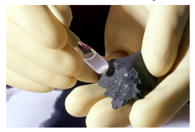
Figure 14.10 Murchison Meteorite. A fragment of the meteorite that fell near the small town of Murchison, Australia, is shown next to a small sample of its material in a test tube, used for analysis of its chemical makeup.

The Murchison meteorite (Figure 14.10) is known for the variety of organic chemicals it has yielded. Most of the carbon compounds in carbonaceous meteorites are complex, tarlike substances that defy exact analysis. Murchison also contains 16 amino acids (the building blocks of proteins), 11 of which are rare on Earth. The most remarkable thing about these organic molecules is that they include equal numbers with right-handed and left-handed molecular symmetry. Amino acids can have either kind of symmetry, but all life on Earth has evolved using only the left-handed versions to make proteins. The presence of both kinds of amino acids clearly demonstrates that the ones in the meteorites had an extraterrestrial origin.