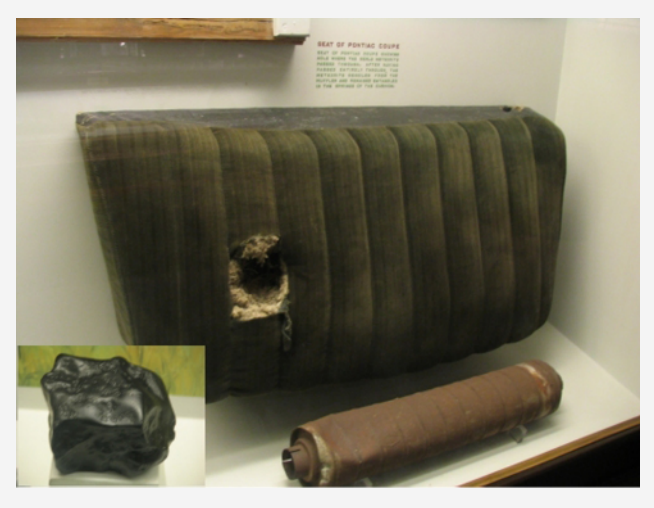
Figure 14.8 Benld Meteorite. A meteorite (inset) left a hole in the seat cushion of Edward McCain's car.

buildings. None is known to have hit people, however, and the individual meteorites were so small that they did not do much damage—much less than the shockwave from the exploding fireball, which broke the glass in thousands of windows.